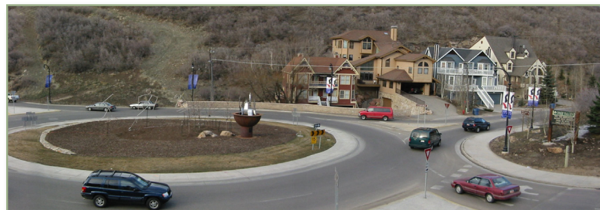
Typical single lane roundabout