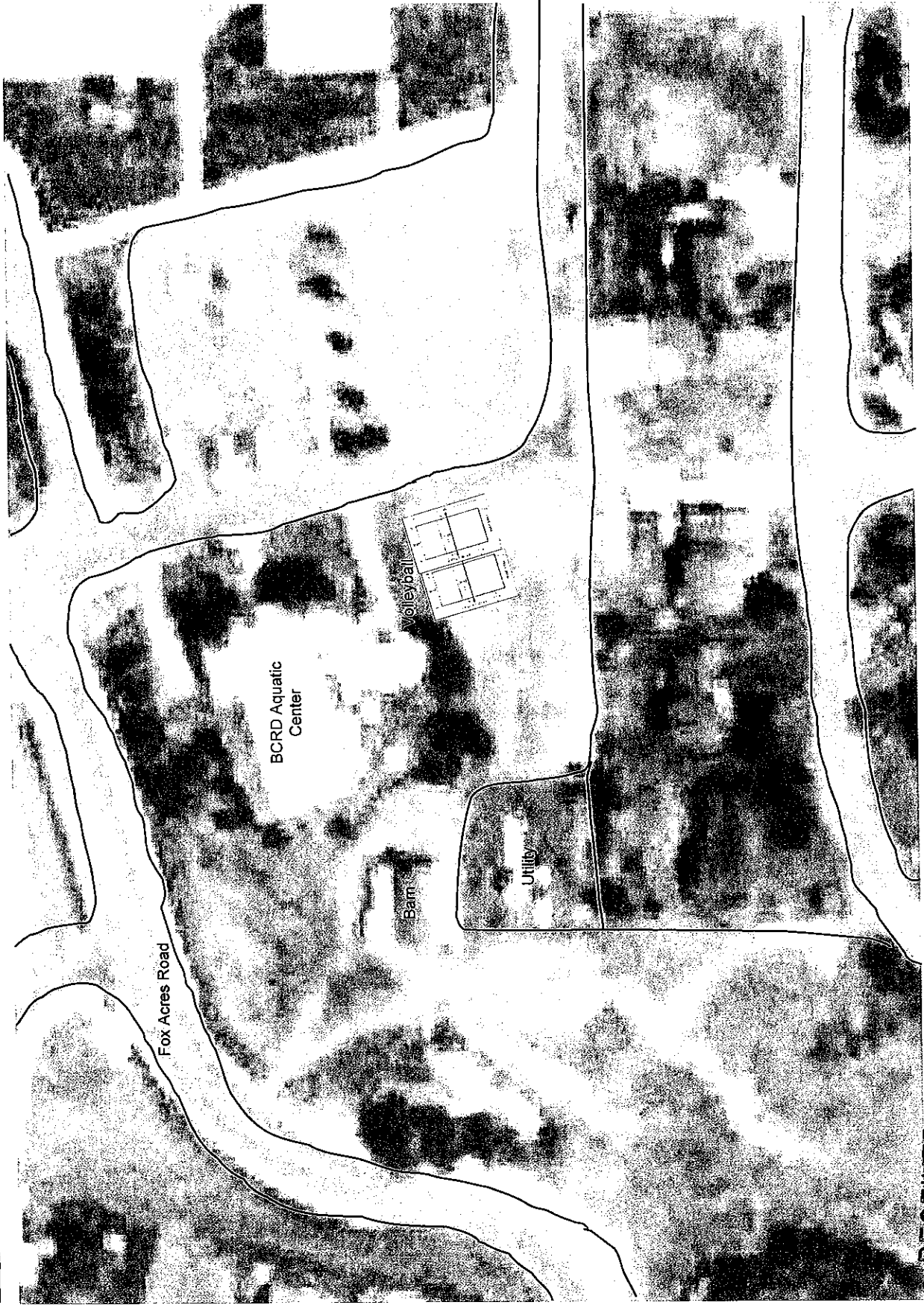
Diagram #1 - Court Placement